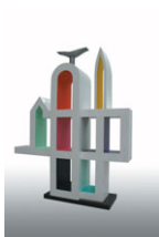
Alessandro Mendini, San Francisco, inter-wall, Cleto Munari, 2008