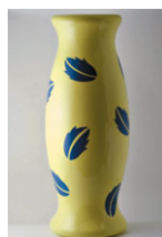
Alessandro Mendini, Mendinismi: Diderot, vase in fiberglass, Corsi Design, 2008