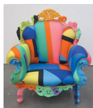
Alessandro Mendini, Geometric Armchair, Cappellini, 2009