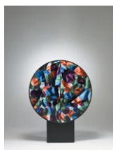
Alessandro Mendini, San Francisco, inter-wall, Cleto Munari, 2008