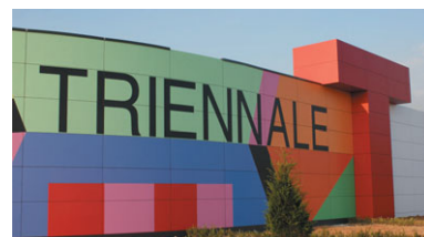
Alessandro Mendini, Triennale di Milano, new building at Incheon, Korea, 2009

Please direct your inquires about the products to the following: