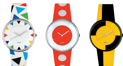
AL8012 AL8013 AL8014